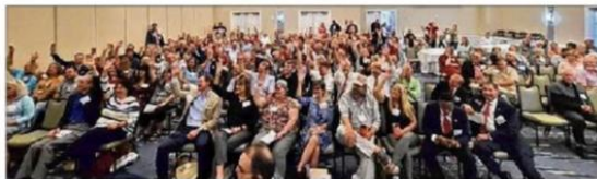
First-time attendees raise their hands during the 1st Congressional District GOP meeting this month. The southeast Georgia district stretches from Valdosta to Savannah.